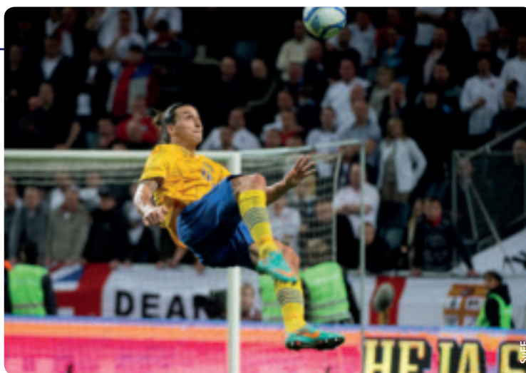
Four goals against England for Zlatan Ibrahimović, including a spectacular bicycle kick

Ibrahimović's extraordinary performance against England came days after he was presented with "Guldbollen" (the Swedish