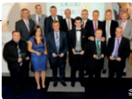
The award winners from an evening celebrating grassroots football

Pat Jennings supported the event through his position as head of Northern Ireland football for McDonald's: "I'm delighted that once again the Irish FA and McDonald's have recognised and rewarded the local people who do so much for grassroots football throughout Northern Ireland. The dedication, commitment and