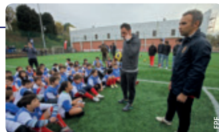
Young Portuguese footballers learn more about the role of the goalkeeper

In parallel, the FPF and Desporto Escolar have developed the "Technique-spotting goes to School" initiative, which seeks to draw children's attention to the emergence of a new activity: technical analysis and observation of the game. This initiative highlights the work carried out by the FPF's observation and analysis