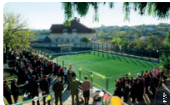
The 150th mini-pitch in Moldova was installed in Razeni