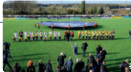
A cup final atmosphere at the stadium in Labeuvrière

The team with the most votes would have its sixth round match in the French Cup treated like the final. Consequently, all the things that are normally reserved for the Stade de France came to Labeuvrière: the trophy was there; a press conference was held on the eve of the match; there were reports on preparations at the club and in the village; the stadium was decked out in the colours of the French Cup; entertainment was organised; and supporters' kits containing