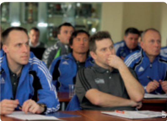
The Pro licence students