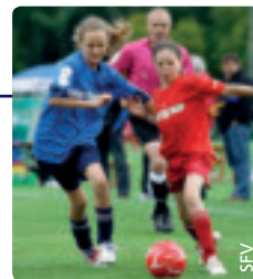
The schools football championship is steadily growing in popularity among both boys and girls