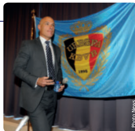
Howard Webb exudes a passion for refereeing

He accepted that refereeing was difficult – all the more so given that both the pace of the game and the rewards at stake are constantly increasing – but insisted that you should always believe in yourself. Howard Webb had a dream and, with perseverance, he has made it to the