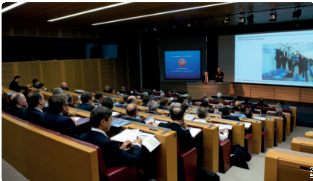
Representatives of UEFA's member associations listen attentively to the explanations of UEFA's refereeing officers

Collina emphasised that football's evolution over the past decade had helped create the need for additional assistant referees. "The biggest change in the last ten years has been speed," he reflected. "With football getting even faster and the players fitter, it seems that sometimes the men in black face a 'mission impossible'," he added. "Two extra pairs of eyes focusing on the penalty areas are of valuable assistance to the referee, and strengthen the refereeing team in confidence and numbers, while allowing the game to flow." ●