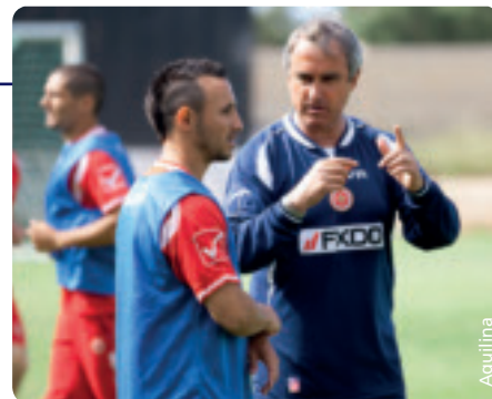
Coach education is a top priority for the Malta Football Association