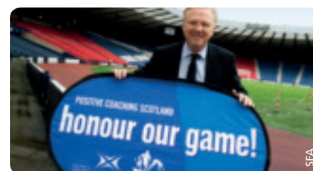
Alex McLeish is giving his support to the Scottish Football Association's playing environment programme