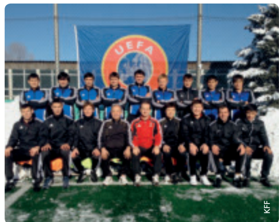
A number of former top Kazakh footballers are studying for their coaching licences