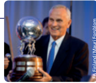
Richard Møller Nielsen was delighted to receive the Captain's Ball

"I have always felt welcome and at home in Finland, together with my wife. I appreciate this recognition tremendously, especially as it involves such a great player and professional as Jari Litmanen. I still closely follow Finnish