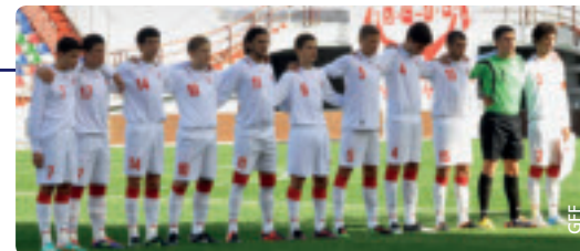
The Georgian Under-17 national team