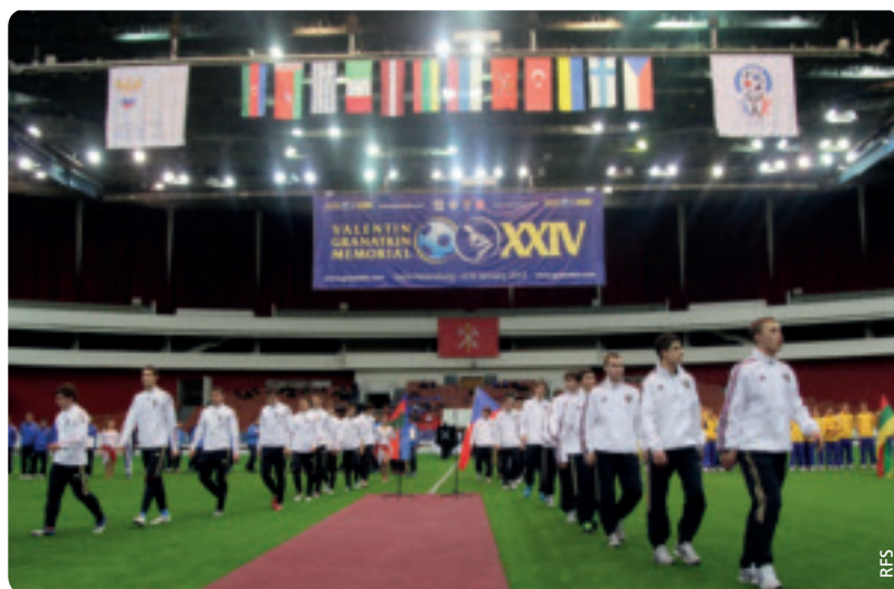
The Valentin Granatkin memorial tournament has become a traditional fixture in the Russian football calendar