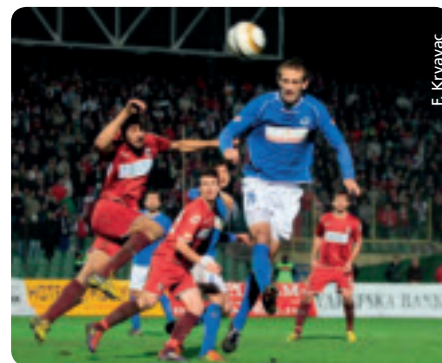
FK Sarajevo (in red) came away with the spoils from their 100th derby against FK Željezničar