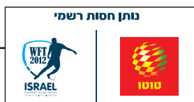
The tournament logo

This tournament is an opportunity for top players from all over Europe to show what they can do. Over the years, many great players have come to participate in this tournament with their national teams – players such as Luís Figo (Portugal), Gheorghe Hagi (Romania) and Brian Laudrup (Denmark). All of the great Israeli footballers have played in the tournament, which the Israel Football Association (IFA) regards as an important part of its