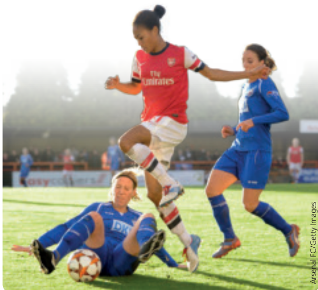
Arsenal (Rachel Yankey, in red) emerged victorious from their round of 16 tie against 1. FFC Turbine Potsdam in the UEFA Women's Champions League

By scoring 11 goals without reply in their two matches against the Russians of FK Zorkiy Krasnogorsk, the title holders, Olympique Lyonnais, breezed their way into the UEFA Women's Champions League quarter-finals.