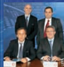
The representatives of the Albanian FA sign the UEFA Grassroots Charter

On the same day in Nyon, the leaders of the Cyprus Football Association signed the UEFA Coaching Convention at Pro level (see page 17). All 53 UEFA member associations now belong to the convention and Cyprus is the 43rd to have been accepted at the highest level.