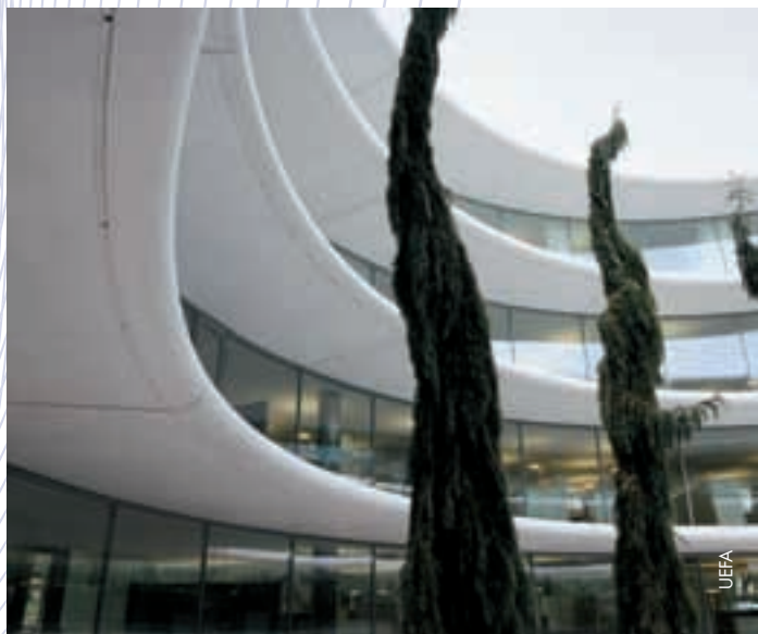
The new building viewed from the inner courtyard

The visitors were also able to visit the Colovray sports centre, which houses the sports facilities that complete the UEFA "campus". Managed by UEFA since 1 April 2010 following the conclusion of a 49-year lease agreement with the local authorities of Nyon, approved at the Executive Committee meeting in Malta, the sports