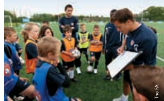
Young participants in the FA Tesco Skills Programme listen attentively to Frank Lampard

Hugh Robertson said: "This type of private/public partnership, from Tesco and The FA, is something I want to encourage in grassroots sport. Millions more young people across the country will get the chance to receive proper coaching,