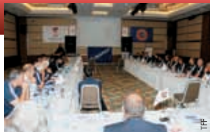
A fruitful exchange of experiences and opinions

Participants had the opportunity to share information about events and applications in