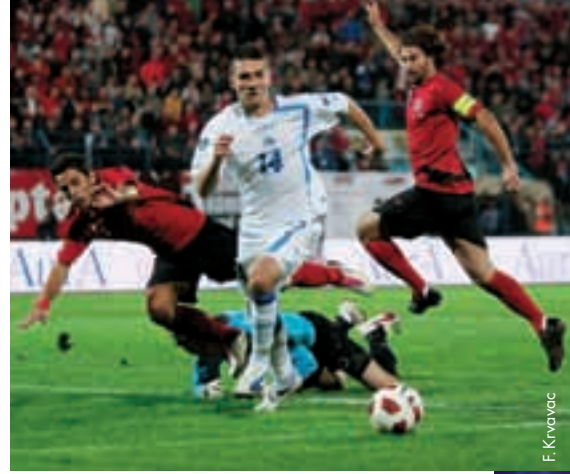
Vedad Ibisevic (14) in action against Albania

Turning to the UEFA EURO 2012 qualifiers, our senior national team, coached by Safet Susic, drew 1-1 against Albania at the Qemal Stafa stadium in Tirana, leaving Bosnia and