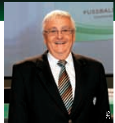
Theo Zwanziger after his re-election as president of the German FA

The re-elected DFB president summarised his goals for his next term of office in a five-point plan and called for football to be value-oriented. Apart from sporting success, Zwanziger's top priority is integration and the fight against discrimination. "Football is the future, football is emotional, football is social," said the 65-year-old, "and it should have a lasting impact."