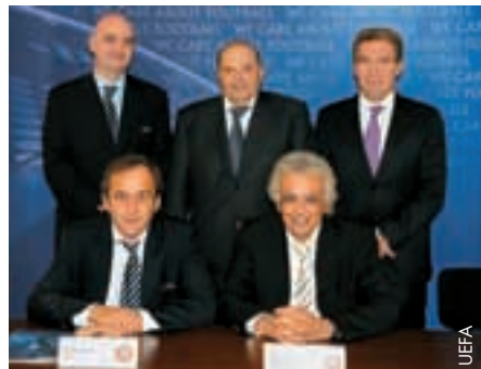
The ratification ceremony in Nyon with representatives of UEFA and the Cyprus FA

The Cyprus FA (CFA) has officially joined the Pro level of the UEFA Coaching Convention.