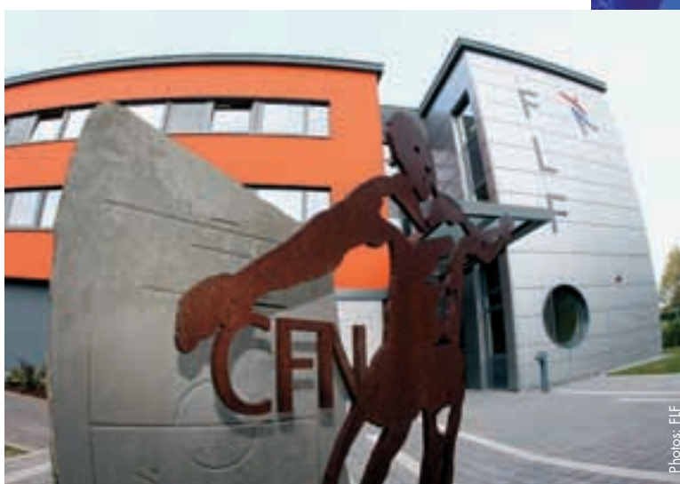
The new centre in Mondercange

The football academy for young footballers is already a decade old. From now on, the Mondercange centre will also be able to host training courses for qualified coaches, referees and administrators.