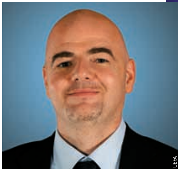
Gianni Infantino UEFA General Secretary

UEFA takes its job as a protector of football seriously. It will continue to promote the values of integrity and fair play relentlessly, in order to preserve the glorious uncertainty of our game.