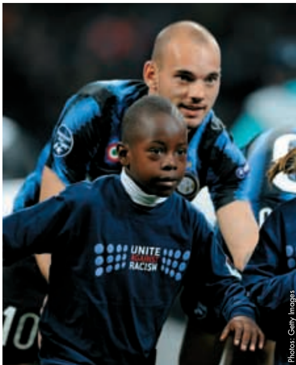
Wesley Sneijder of FC Internazionale accompanied by a young player wearing a Unite Against Racism T-shirt at Inter's UEFA Champions League match against Tottenham Hotspur on 20 October in Milan

UEFA has been working with FARE for nine years now and has given its partner strong backing in fighting the negative phenomenon of racism. In addition, UEFA's Respect campaign urges similar values – respect not only for opponents and match officials, but also for rival supporters, national anthems, flags, tournaments – and football. The two bodies have organised a number of events together – and the 2010 FARE action week once