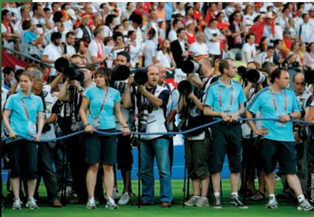
Volunteers assisting with media activities during EURO 2008