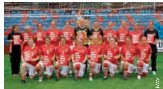
The Wales women's team takes a stance against racism.