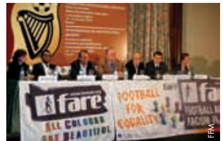
Conference on overcoming racism and discrimination