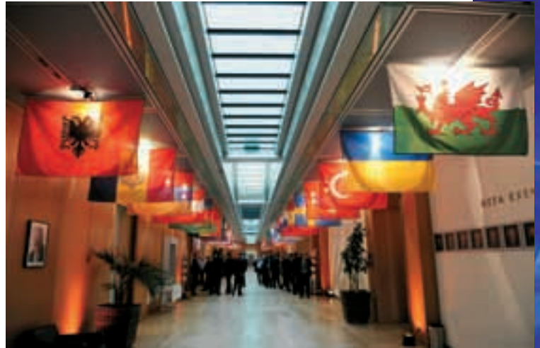
A festive atmosphere in the corridors of the House of European Football

The circular building contains 6,000m 2 of office space for around 240 members of staff, spread over four floors, with a fifth level reserved mainly for logistics. The adjacent underground car park has room for 200 cars. Designed by the Geneva-based firm of architects Bassi and Carella, La Clairière meets high environmental standards thanks to various energy-efficient features. For example, it is covered in 110m 2 of solar panels that produce hot water and help power the air-conditioning system. Photovoltaic solar panels (220m 2 ) also generate some of the building's electricity supply, while geothermal probes help to air-condition the building. It is also interesting to note that the concrete eaves are designed to offer protection from the sun in the summer without the