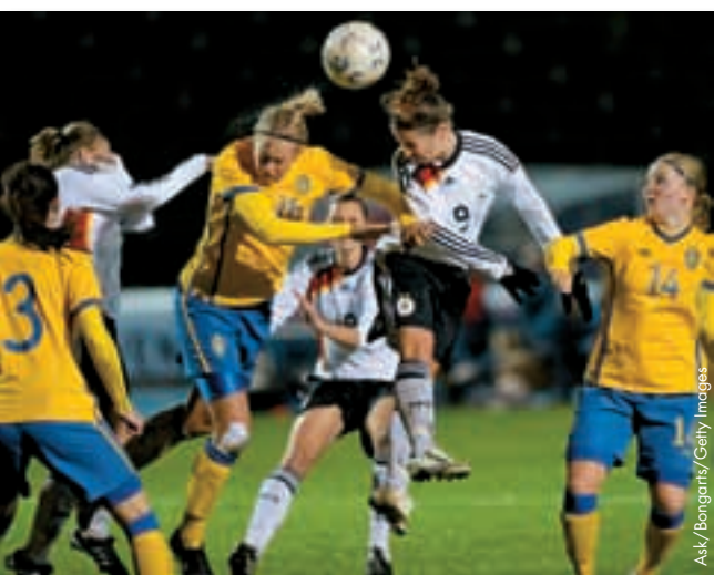
Sweden and Germany (picture here during a friendly match) have both qualified for the second qualifying round of the European Women's U19 Championship.

The draws for the first qualifying round of the 2011/12 European Women's Under-17 and Under-19 Championships were also held on 16 November.