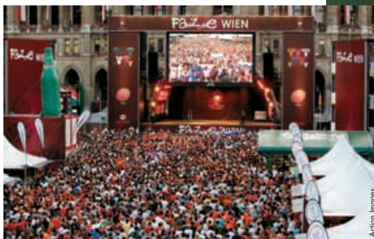
The success of the fan zones also adds to the organisational tasks.

Tournament directors have been appointed for each of the two host countries. Their duties include overall management and administration of each LOC, local media and public relations and approval of the yearly LOC accounts. The host associations have decision-making