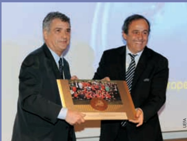
In recognition of Spain's World Cup victory, Michel Platini presents a plaque to the president of the Spanish federation and UEFA vice-president, Angel María Villar Llona.

UEFA aims to use these facilities to create a football centre of excellence. An initial step has already been taken in the field of refereeing with the organisation of the first training course for young European referees in September (see UEFA-direct No. 102). Training opportunities are also planned for coaches and doctors, leaving the door wide open for other activities and projects that correspond with the first of the 11 principles approved by the 2009 Congress in Copenhagen: Football First. ●