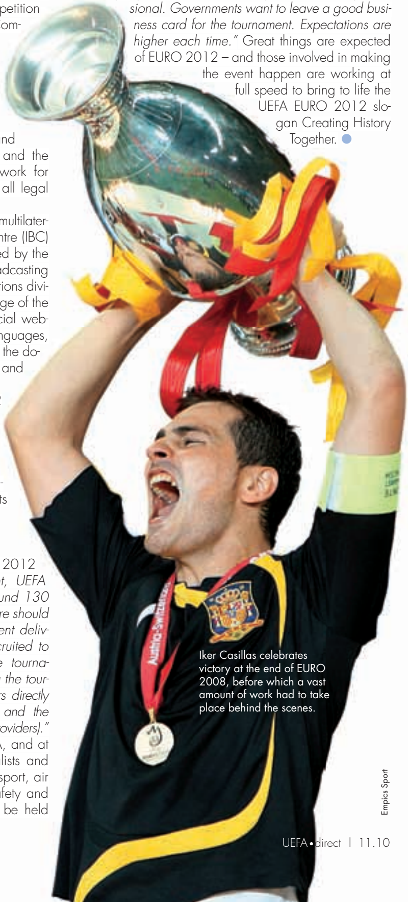
Iker Casillas celebrates victory at the end of EURO 2008, before which a vast amount of work had to take place behind the scenes.