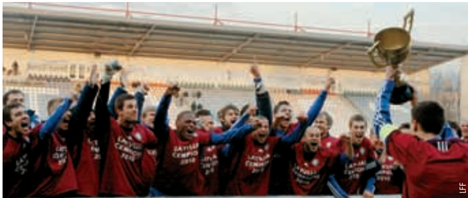
A 15th league title for FC Skonto