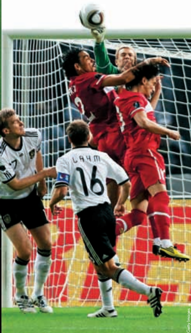
Germany's goalkeeper, Manuel Neuer, resists a Turkish attack during the match won by Germany 3-0 in Berlin.

by the second coming of Egil Olsen. The biggest surprise was the blistering start made by a Montenegro side competing as an independent nation for the first time in the European Football Championship.