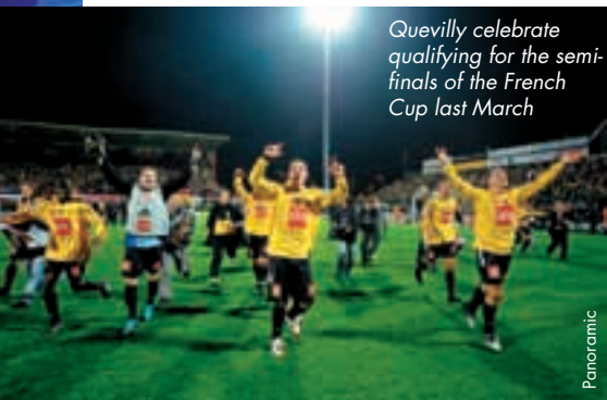
Quevilly celebrate qualifying for the semi-finals of the French Cup last March