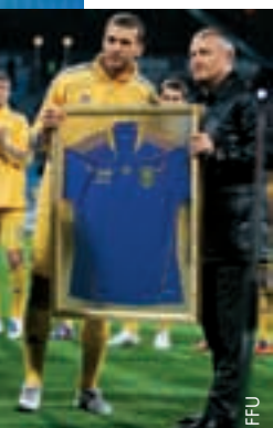
Grigoriy Surkis, president of the Ukrainian FA, presents a commemorative jersey to Andriy Shevchenko.

"I am delighted to have reached this landmark with the national team. The number 100 is something special when you're talking about appearances for your country. I had to wait ten long years to reach my century. I think it's very important for any footballer because there are very few players in the world who get so many caps," said the 31-year-old from FC Bayern München.