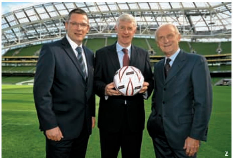
Three of the coaches at the announcement of the fixtures and dates for the Carling Nations Cup. Left to right: Nigel Worthington (Northern Ireland), Craig Levin (Scotland) and Giovanni Trapattoni (Republic of Ireland).