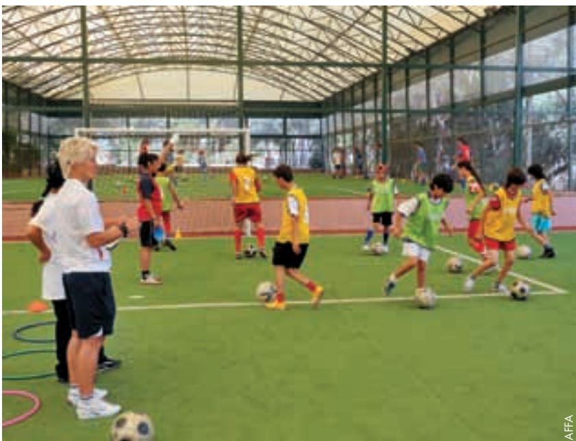
A training session during the women's football festival